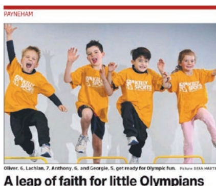
A leap of faith for little Olympians

We have been kept busy throughout Term 3 with our Kelly Sports birthday parties. Football and soccer were the much sought after themes during the winter months.